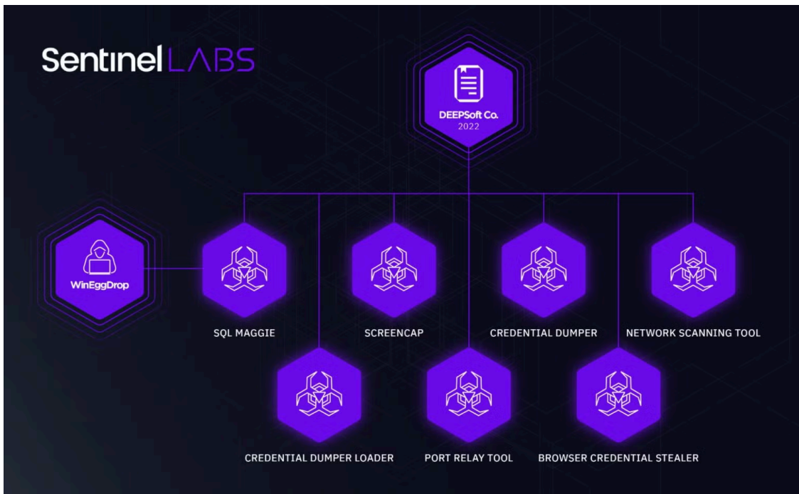
Relationship between the malware, certificates, and creators

This report focuses on detailing the set of activity we track as WIP19 and provides further context around the usage of these new tools.