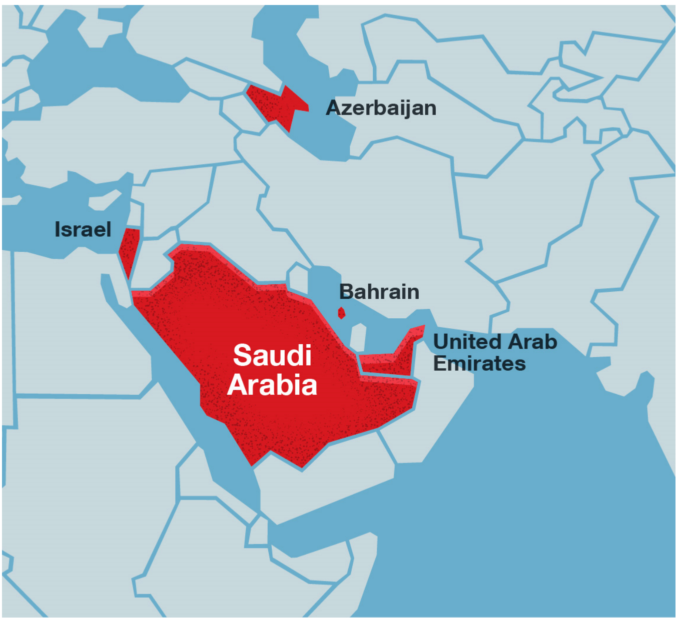
Figure 11. Affected countries

We observed Earth Vetala target the following sectors: