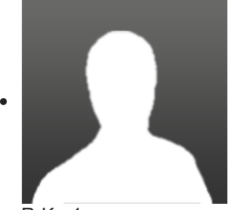
<u>R-K</u> - 1 year ago

As you can see, Belarus is only on the 5th place in this list.