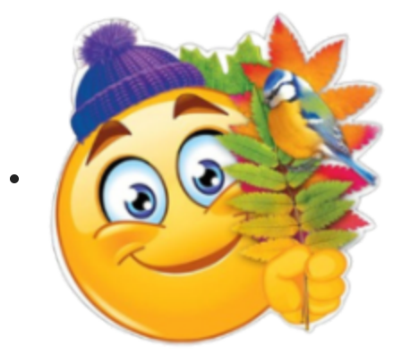
Amigo-A - 1 year ago