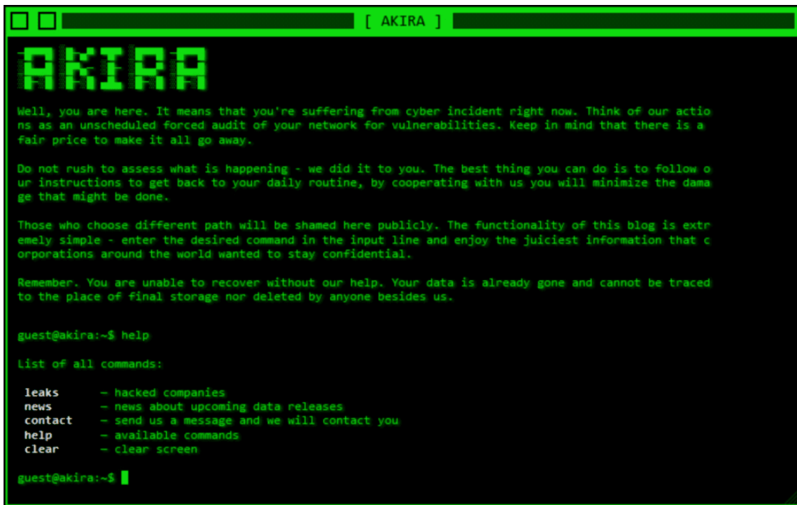
Image representing Akira Tor leak site