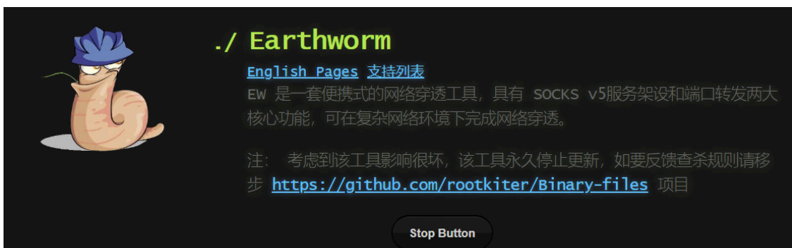
Figure 3. Screenshot from the EarthWorm website.

As shown in Figure 2 above, the attackers used EarthWorm (ew.exe) to create a tunnel to their C2 traffic that was hosted on 27.124.26[.]86. This tunnel allowed the attackers to connect the local area network (LAN) of the infected network to their external C2. Figure 3 shows a screenshot of the EarthWorm website.