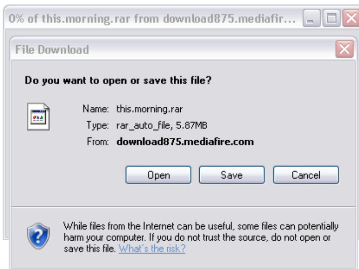
Figure 1: Prompt to download RAR to local system

The file “this.morning” is a RAR self-extracting (SFX) archive (cd89897a2b6946a332354e0609c0b8b4). Once downloaded, the user opens the RAR which extracts what appears to be a video file named “this.morning”.