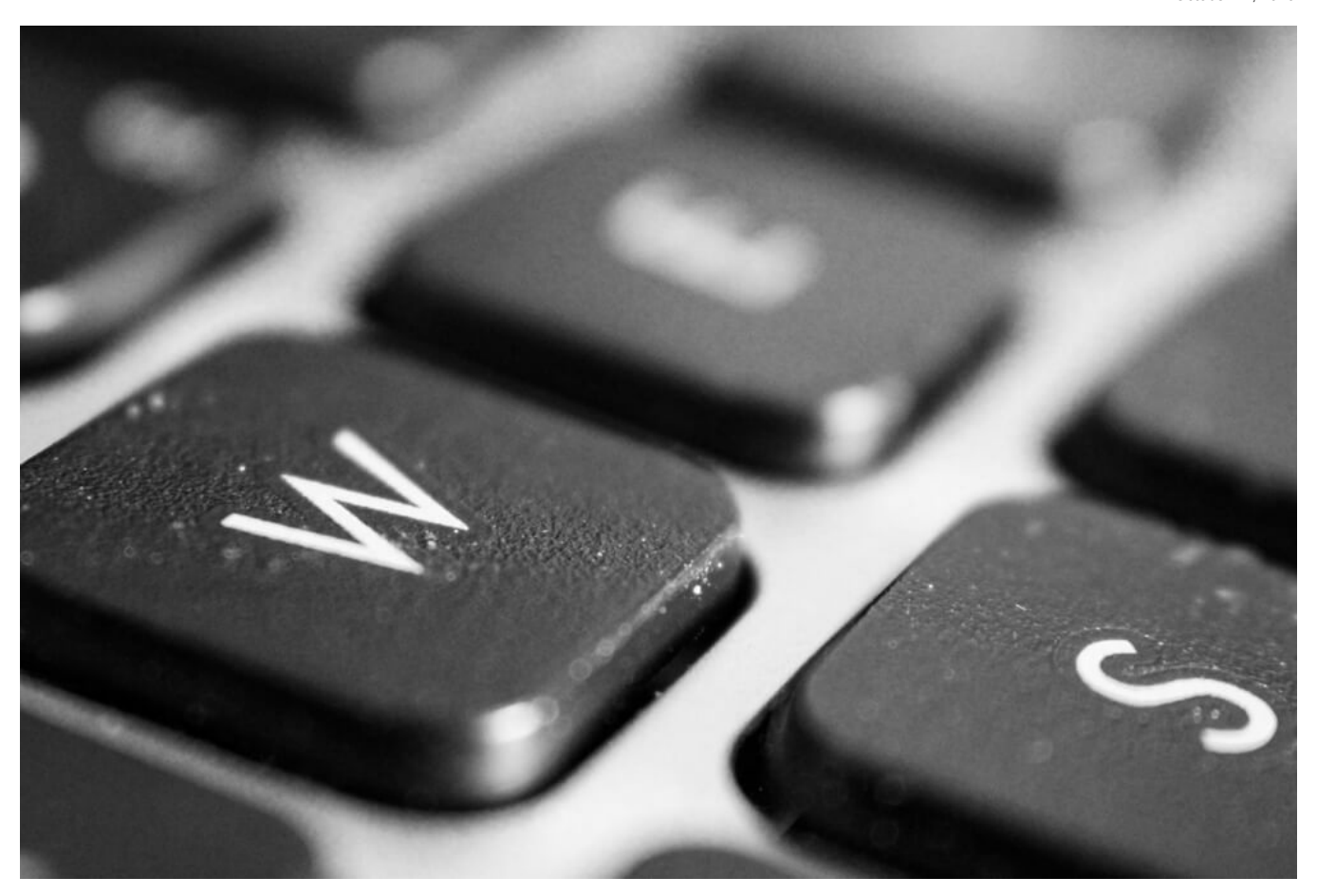
Notorious cyberespionage group debases MSSQL