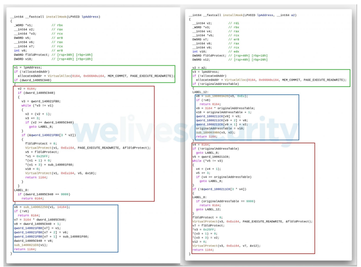
Figure 3. Hex-Rays output comparison between the NetAgent (left) and skip-2.0 (right) hooking procedures

The hooking procedure used by skip-2.0 is very similar to the one used by NetAgent , the PortReuse module responsible for installing the networking hook. This hooking library is based on the <u>distorm</u> open source disassembler that is used by multiple open source hooking frameworks. In particular, a disassembling library is needed to correctly compute the size of the instructions to be hooked. One can see in Figure 3 that the hooking procedure used by NetAgent and skip-2.0 are almost identical.