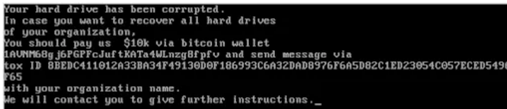
Figure 2: Ransom note displayed after stage 1 of WhisperGate is executed

PhysicalDrive0 is making an assumption that that disk is the first one in line to be checked by the BIOS, which is normally a reasonable assumption. Once the machine reboots and the custom MBR code executes, the user is presented with the ransom note displayed in Figure 2.