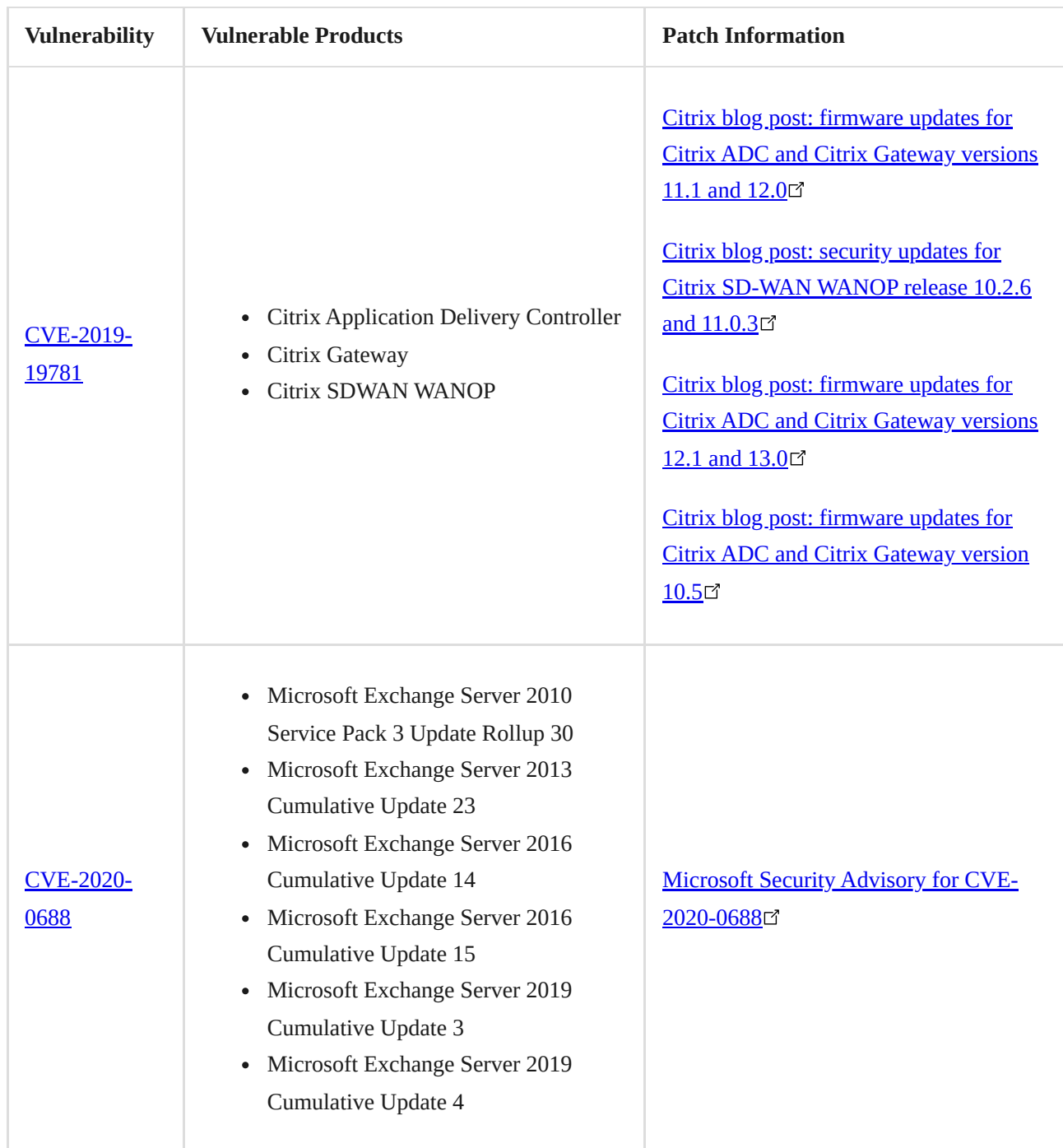
Table 1: Patch information for CVEs