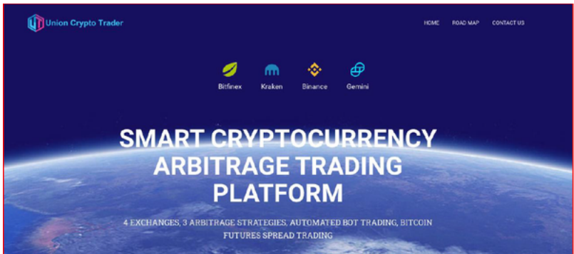
Figure 1 - Screenshot of the Union Crypto Trader website.

The domain is registered with NameCheap at the IP address 104.168.167.16 with ASN 54290. Screenshots