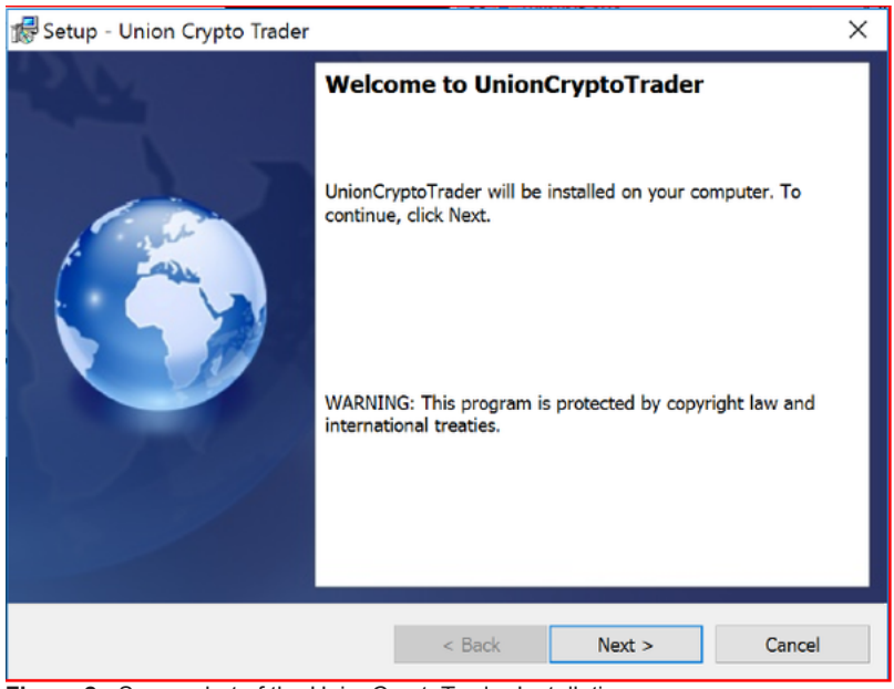
Figure 2 - Screenshot of the UnionCryptoTrader Installation.