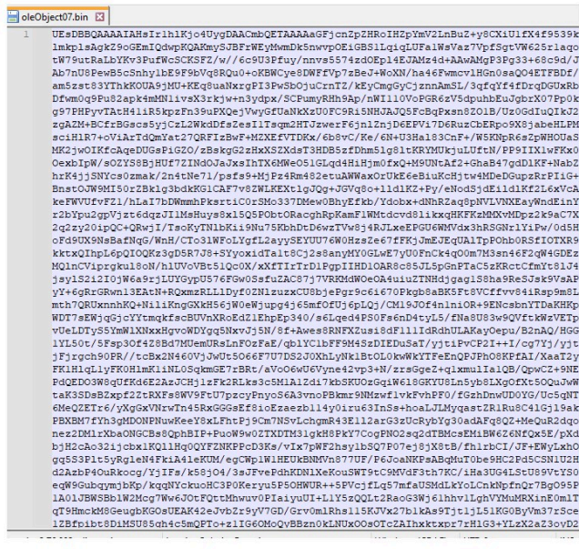
Figure 5: Base64 decoding