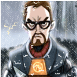
Figure 4. Animated GIF “anyway.gif” from UPS Campaign Exploiting CVE-2014-1776