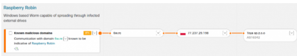
Image 3: Raspberry Robin detection sample in Cisco Global Threat Alerts

In Cisco Global Threat Alerts available through Cisco Secure Network Analytics and Cisco Secure Endpoint , we track this activity under the Raspberry Robin threat object. Image 3 shows a detection sample of Raspberry Robin: