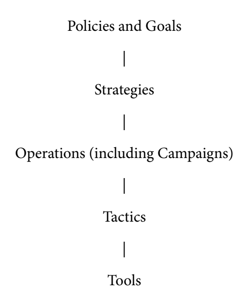
Figure 1-1 – Strategic Thought, Adapted for Digital Conflict

In this chapter, the author argues that decision-makers need to better understand the role of technology in strategic thought, and so it adds a new level below the tactical layer: 'tools'. Certainly in physical warfare one uses 'tools' to inflict kinetic dam-