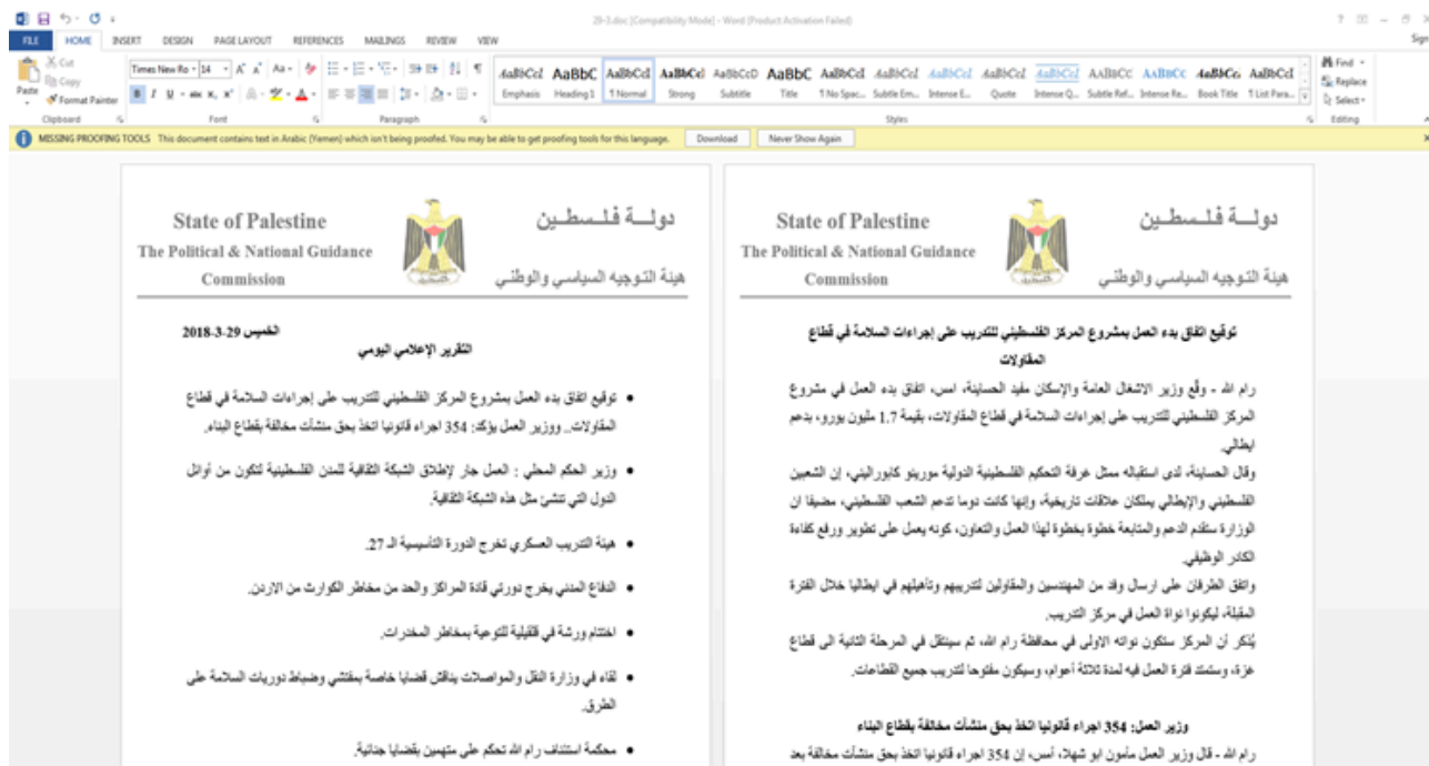
Figure 1: Screenshot of Word Document.

While the victim is distracted with the legitimate looking Word document, an additional executable which is archived alongside the decoy document is installed in the background.