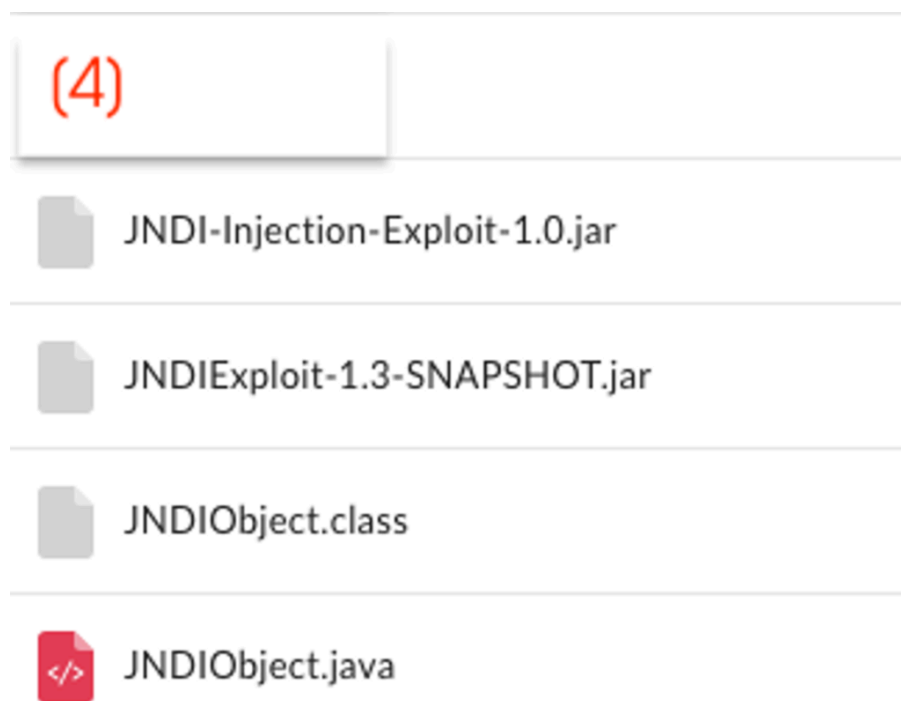
Figure 3. Suspected Log4j

Based on the telemetry available to OverWatch threat hunters and additional findings made by CrowdStrike Intelligence, CrowdStrike assesses that a modified version of the Log4j exploit was likely used during the course of the threat actor’s operations.