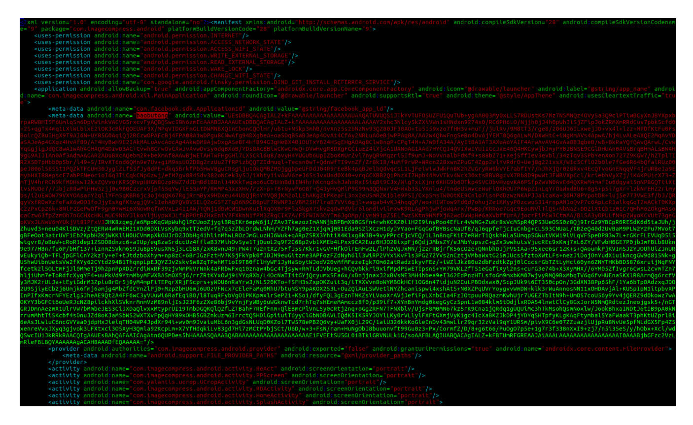
Figure 5 – Manifest file containing the Base64 encoded dex

The first method used to load the dex file was to read it from the manifest file. When inspecting the manifest file, we could see that there was another metadata field that contained a Base64 encoded dex file. So all that was needed was to read the data from the manifest file, decode the payload, and load the new dex file.