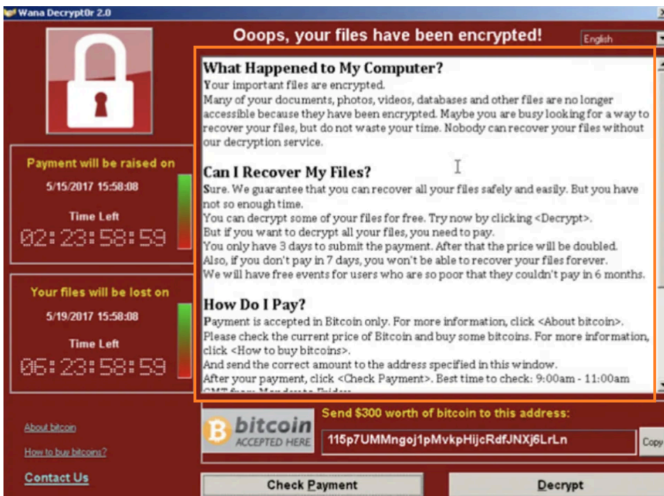
The ransom note for WannaCry ransomware.

The ransom note text resembles the well-known WannaCry ransom note , possibly to obfuscate the threat actor’s identity and confuse incident responders.