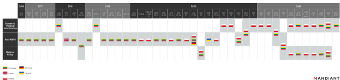
Figure 2: Ghostwriter Operations 2016-2021

Pre-2020 Ghostwriter information operations were primarily anti-NATO, but since mid-2020 they have focused on Belarus’ neighbors.