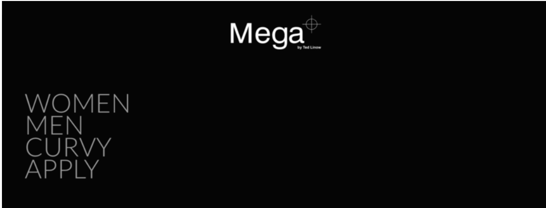
Figure 1. Fake Mega Model Agency website.

While monitoring infrastructure we assess is likely tied to Iranian cyber actors, we discovered the domain megamodelstudio[.]com. This domain was registered on Feb. 18, 2025, and has resolved to 64.72.205[.]32 since March 1, 2025. This domain hosts a website impersonating the Hamburg-based Mega Model Agency , as illustrated in Figure 1.