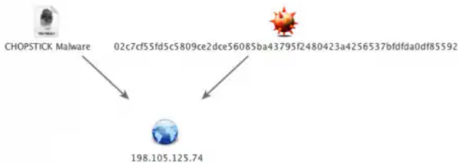
Figure 8: Sample 2 C2 resolutions

The first of the newer samples (Table 2), continues the trend and beacons to an IP also widely associated with the Sofacy group, 198.105.125[.]74. This IP has been mostly associated with the tool specifically known as CHOPSTICK, which can be read about here .