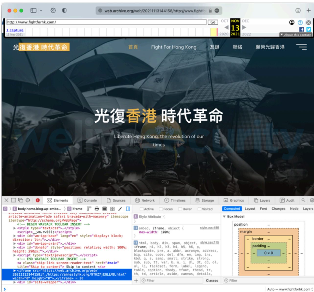
Figure 1. fightforhk[.]com , as archived by the Wayback Machine on November 13th

ESET researchers found another website, this time legitimate but compromised, that also distributed the same exploit during the few months prior to the Google TAG publication: the online, Hong Kong, pro-democracy radio station D100 . As seen in Figure 2, an iframe was injected into pages served by bc.d100[.]net – the section of the website used by subscribers – between September 30 th and November 4 th 2021.