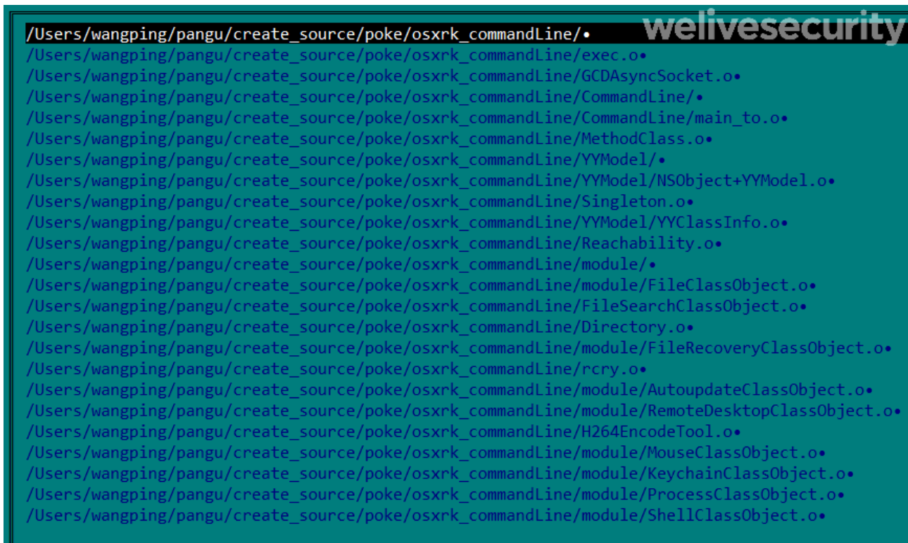
Figure 10. Paths embedded in the DazzleSpy binary

Once the malware obtains the current date and time on a compromised computer, as you see in Figure 11, it converts the obtained date to the Asia/Shanghai time zone (aka China Standard Time), before sending it to the C&C server.