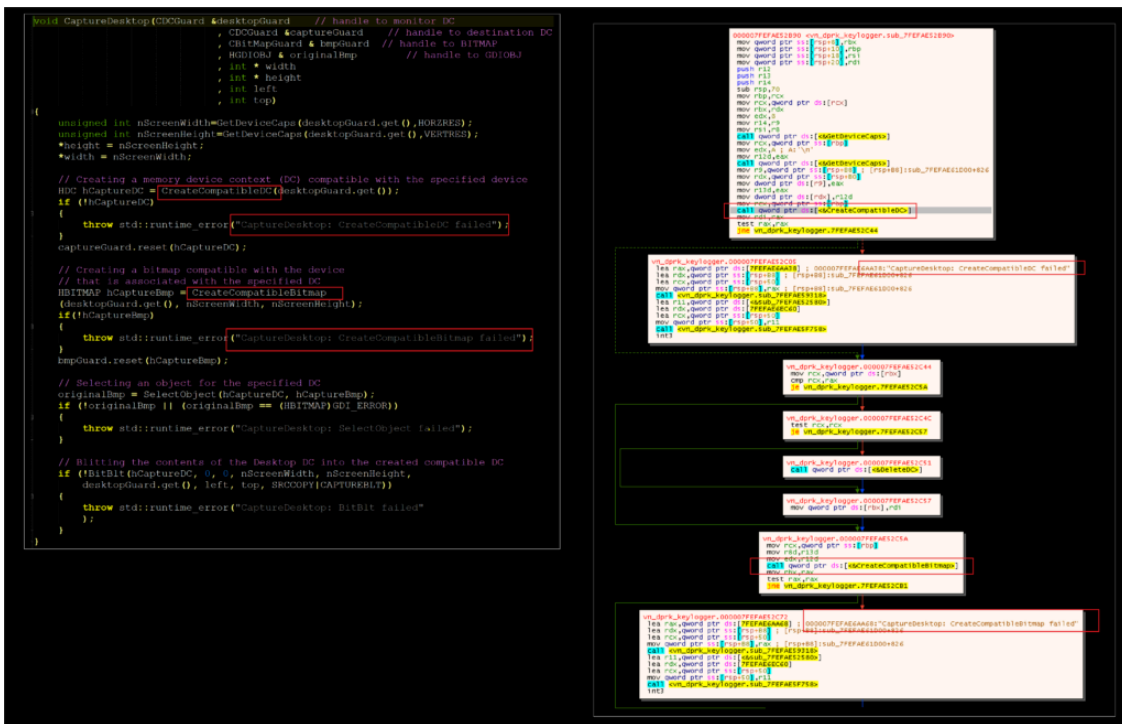
Open-source screengrabbing implementation (left) and disassembled code graph (right).

example (or code from which that example was derived) . To perform compression, the malware uses the XZip library , a derivation of the Info-Zip project. The combination of these characteristics is useful for identifying an additional variant of this malware.