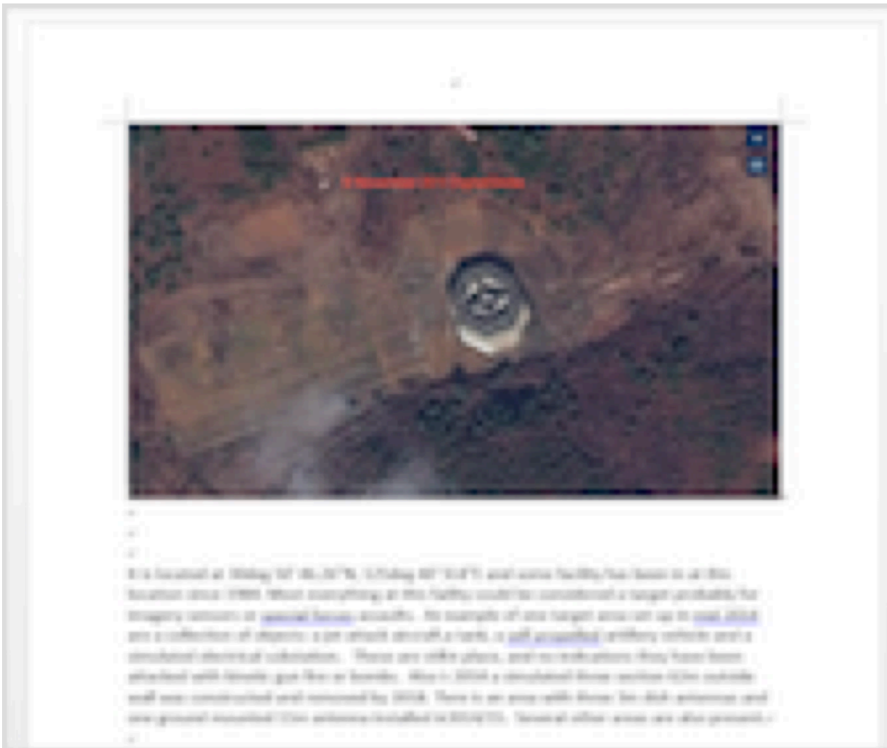
Figure 4 Decoy content not publicly available on the internet (intentionally obfuscated)

The malicious documents contain a simple macro which would load the BabyShark's first stage HTA at a remote location.