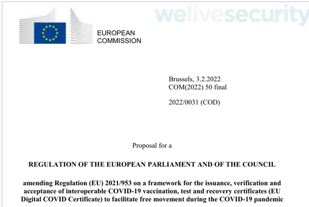
Figure 3. First page of the decoy document for the REGULATION OF THE EUROPEAN PARLIAMENT AND OF THE COUNCIL.exe downloader. It's a real document available on the European Council's website.

To further the illusion, these binaries download and open a document that has the same name but with a .doc or .pdf extension. The contents of these decoys accurately reflect the filename. As shown in Figure 3, at least one of them is a publicly accessible legitimate document from the European Parliament.