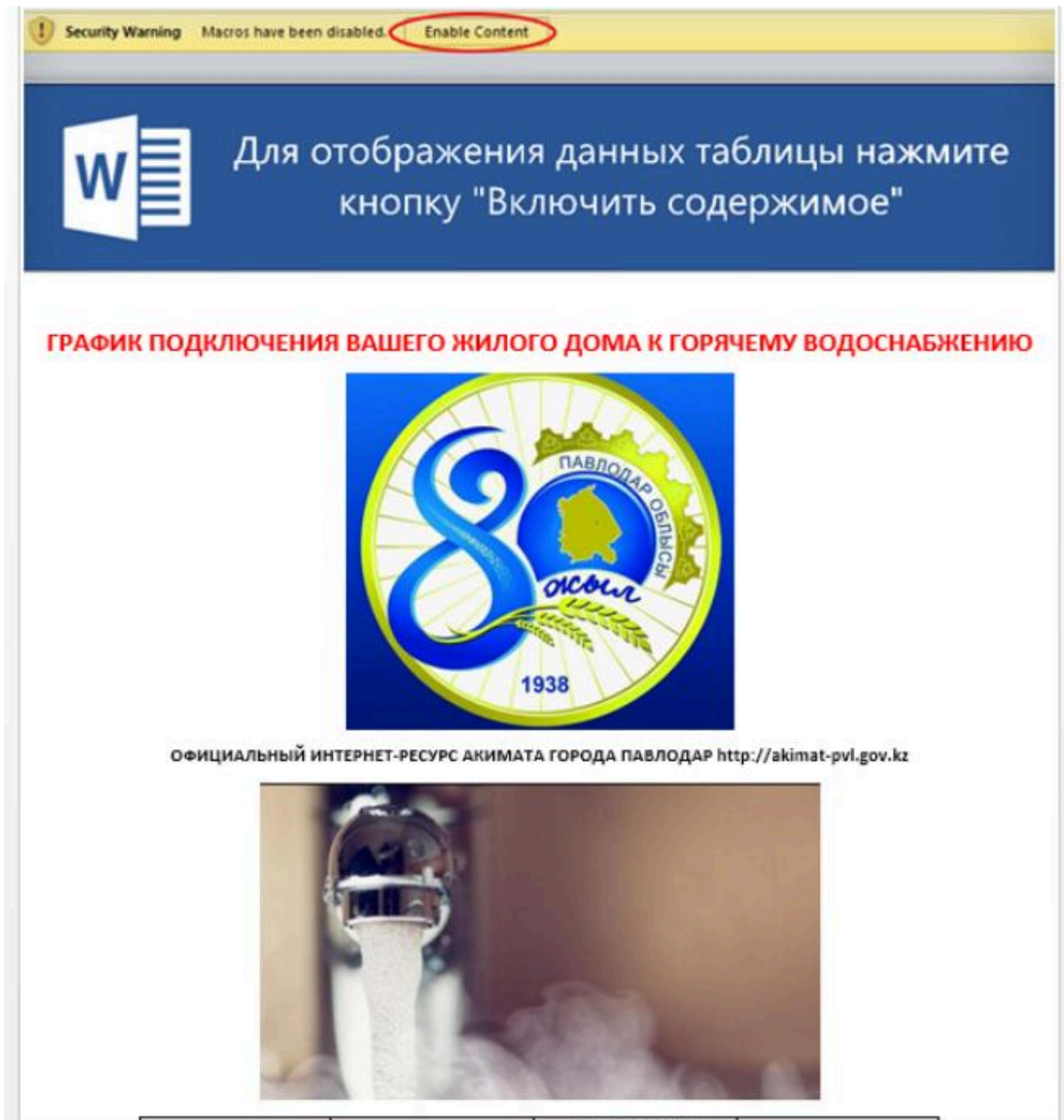
Shown above: Suspected APT28 Lure "gorodpavlodar.doc"

Opening the Visual Basic console via the developer tab in Word reveals a password protected project that would be run if content were enabled. To bypass this password restriction, I opened the document within a Hex editor and searched for the string "DPB=" which contains the VBA password, and changed it to "DPx=". Opening the project following this causes Word to throw multiple errors regarding the invalid key (DPx), but allows me to bypass the password restriction. This allows me to view the contents of the project, displayed below, which looks to be a UserForm containing quite a lot of data in two of the input boxes, in addition to some labels.