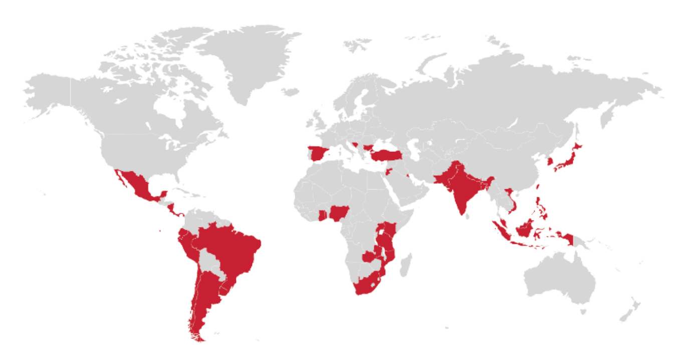
Figure 1: Nations probably targeted by BeagleBoyz since 2015

The BeagleBoyz likely have targeted financial institutions in the following nations from 2015 through 2020: Argentina, Brazil, Bangladesh, Bosnia and Herzegovina, Bulgaria, Chile, Costa Rica, Ecuador, Ghana, India, Indonesia, Japan, Jordan, Kenya, Kuwait, Malaysia, Malta, Mexico, Mozambique, Nepal, Nicaragua, Nigeria, Pakistan, Panama, Peru, Philippines, Singapore, South Africa, South Korea, Spain, Taiwan, Tanzania, Togo, Turkey, Uganda, Uruguay, Vietnam, Zambia (figure 1).