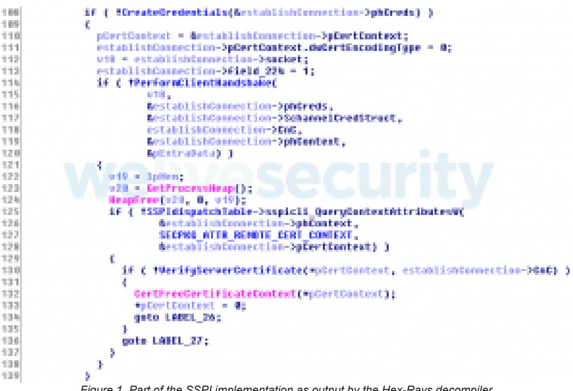
Figure 1. Part of the SSPI implementation as output by the Hex-Rays decompiler

The malware's implementation of TLS via Schannel is similar to this <u>example by Coast Research &</u> <u>Development</u>. It includes creating credentials, performing the client handshake and verifying the server certificate.