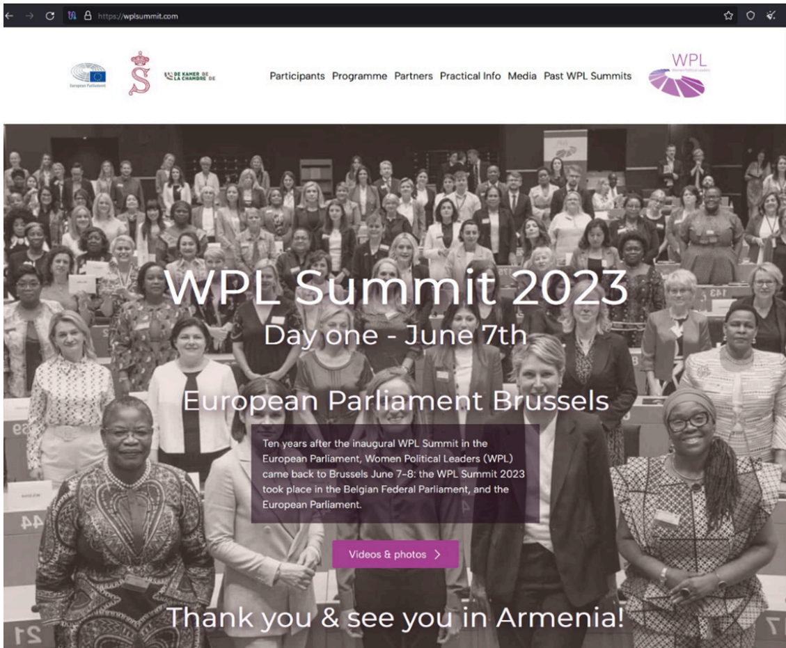
Figure 1. WPL Summit 2023 fake website

While the “Videos & photos” link of the legitimate domain redirects visitors to a Google Drive folder containing photographs from the event, the wplsummit[.]com fake website directed visitors to a OneDrive folder containing two compressed files and an executable called Unpublished Pictures 1-20230802T122531-002-sfx.exe . The latter file appears to be a piece of malware, the binary of which we analyze in the next section.