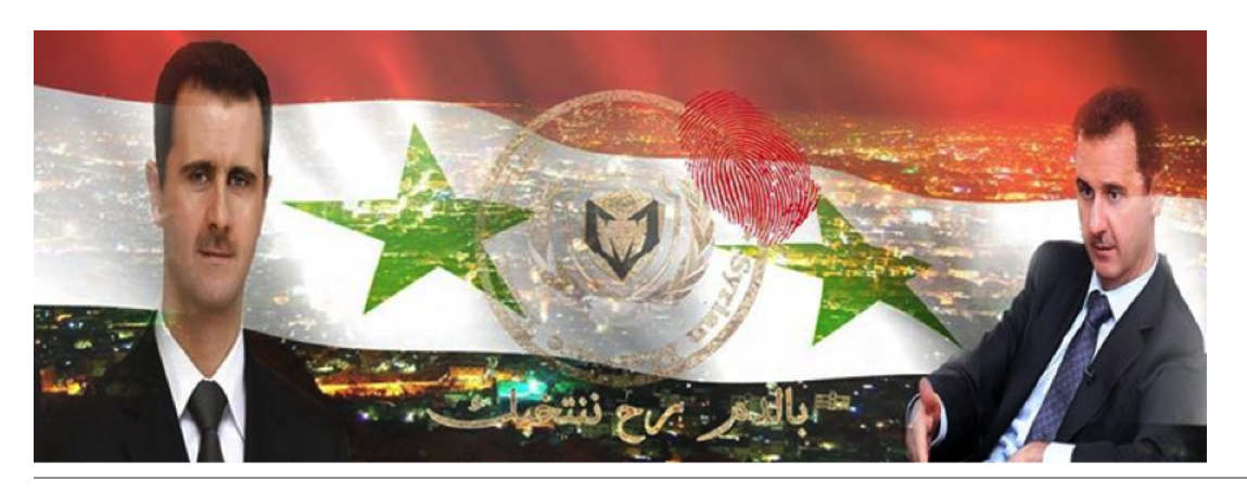
Banner used by the Syrian Malware Team