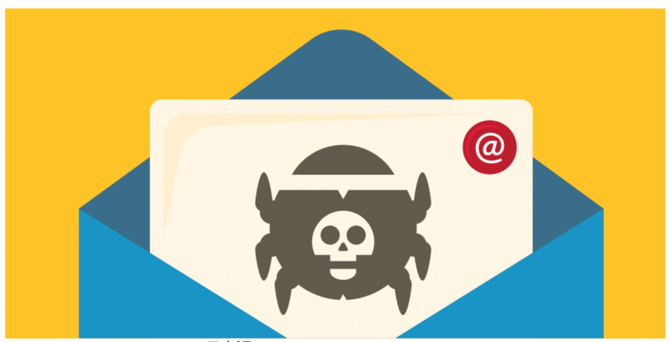
This post is also available in: <a href="#">日本語 (Japanese)</a>

Tags: Asia, China, cyber espionage, Derusbi, Dudell, RANCOR, RAT, Remote Access Trojan