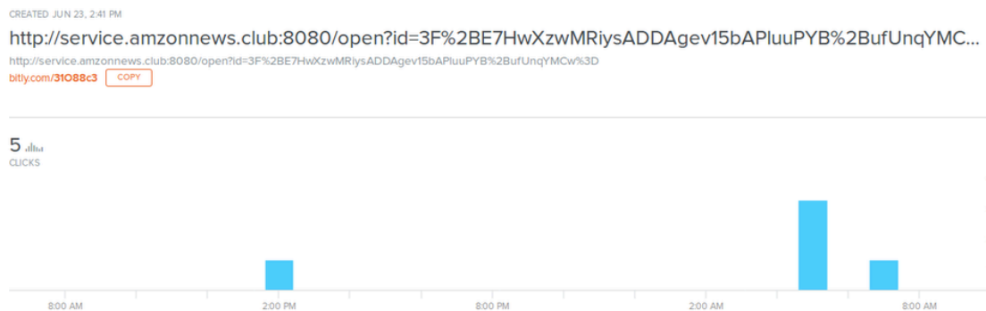
Figure 5 : Access counts to the shortened URL (snipped)

JPCERT/CC observed a limited number of access to the shortened URL (Figure 5). This implies that the attack was conducted against a very limited range of targets.