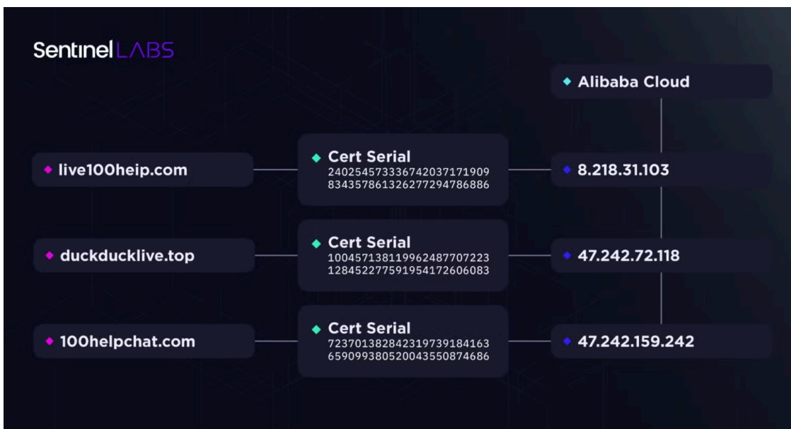
Certificates use on Alibaba IPs

The three domains are each hidden behind CloudFlare, who were quick in remediation after we reported the service abuse. In this case, however, the actors revealed their true-hosting locations due to an OPSEC mistake in their initial deployment of the domain’s SSL certificates on their Alibaba Cloud hosting servers at 8.218.31[.]103 , 47.242.72[.]118 , and 47.242.159[.]242 .