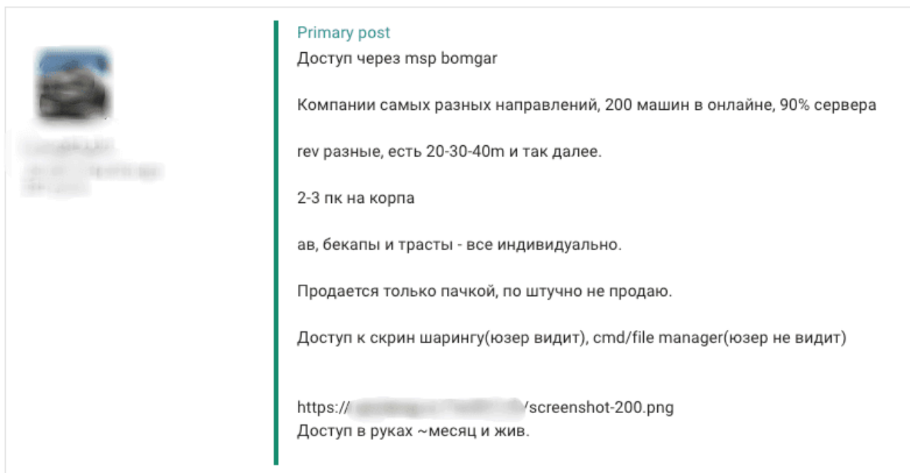
Figure 1: XSS user selling access to an MSP that manages at least 200 machines

For groups like Scattered Spider, IT providers are the master key—the ultimate shortcut to infiltrating multiple organizations at once. These providers manage critical systems and valuable data, making them irresistible targets for hackers who want to maximize their impact with minimal effort. These tactics aren’t just limited to Scattered Spider. For instance, we observed an XSS forum user (see Figure 1) selling access to a remote monitoring and management (RMM) tool dashboard that manages over 200 hosts across many small businesses.