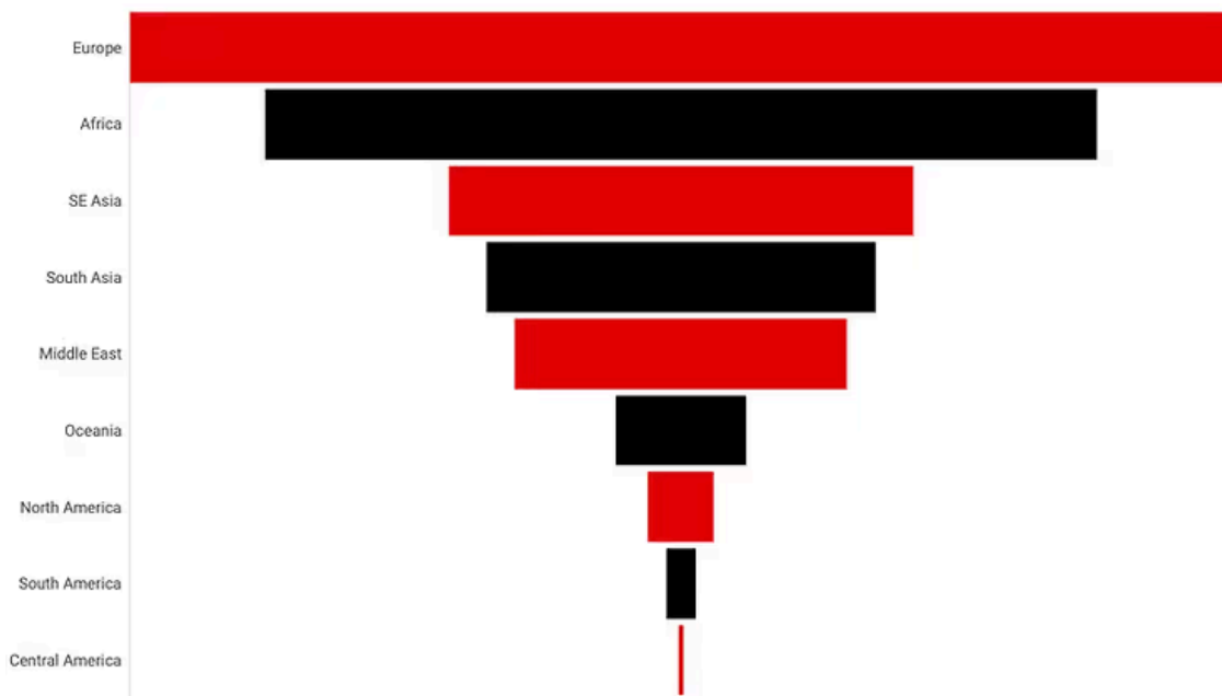
Figure 5: Spread of Victim Communications

Approximately 80% of connections were from the East Asian region (primarily Japan), which could be referred to as the ‘traditional’ operating base of Roaming Mantis. However, when you remove those connections from the data, you’re left with a picture of the operators’ efforts to expand globally.