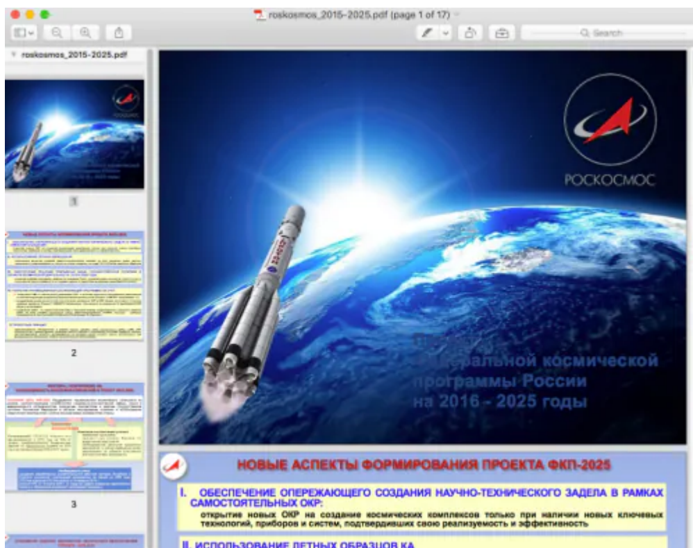
Figure 2 Decoy document opened by Komplex binder showing document regarding the Russian Space Program

The binder component saves a decoy document named roskosmos_2015-2025.pdf to the system and opens it using the Preview application built into OS X. Figure 2 shows a portion of the 17 page decoy document. This document is titled “Проект Федеральной космической программы России на 2016 - 2025 годы” and describes the Russian Federal Space Program’s projects between 2016 and 2025. We do not have detailed targeting information regarding the Sofacy group's attack campaign delivering Komplex at this time; however, based on the contents of the decoy document, we believe that the target is likely associated with the aerospace industry.