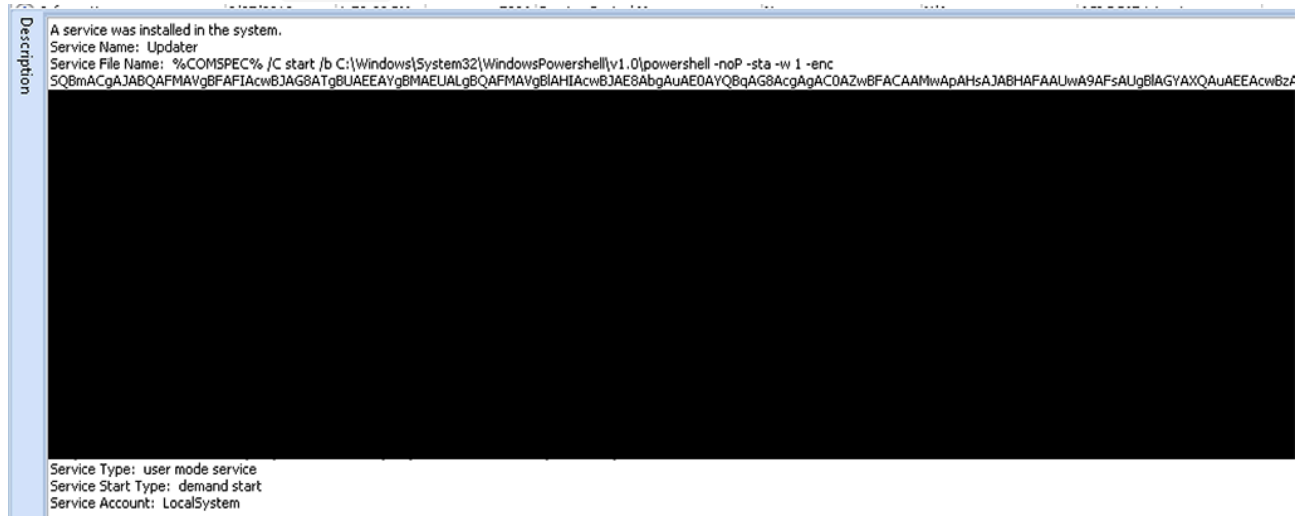
Figure 2. PowerShell Empire Run as a Service

a service with the name Updater , as shown below in Figure 2.