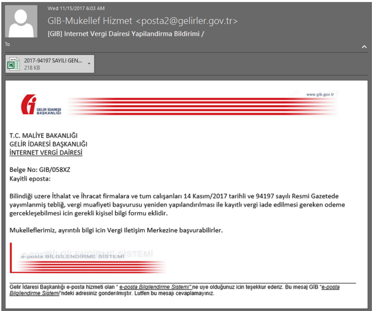
Fig-1 Example of the spear phishing email

RiskIQ identified multiple employees within the targeted organization that were affected. The first email we were alerted to was sent on November 16 at around 6 a.m. The email, which we censored from victim PII, looked like this: