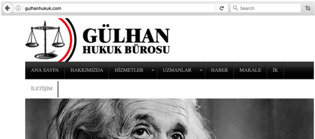
Fig-2 Site for a law firm also hosted on the IP from which the emails came

Proprietary data within RiskIQ PassiveTotal shows the IP sending the email messages hosts a law firm website: https://community.riskiq.com/projects/d731e758-cc96-b68e-4286-fe8b8f2308f1?guest=true :