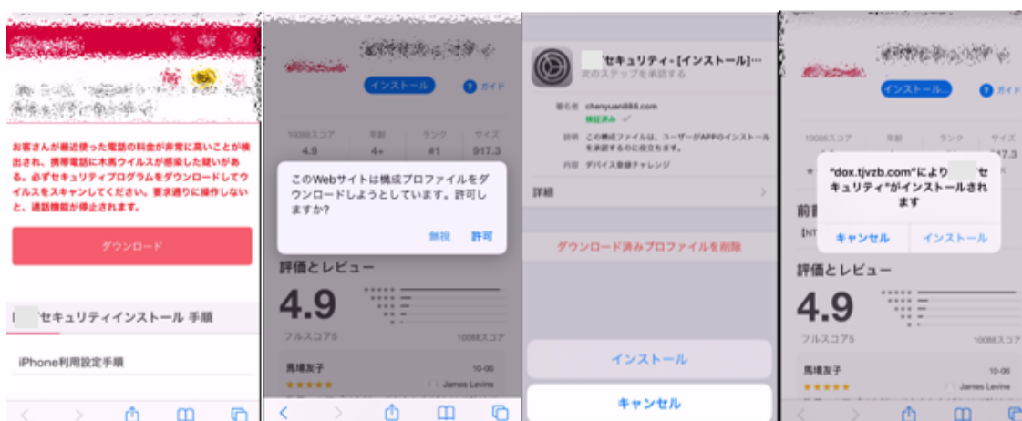
Figure 3. Malicious site accessed from an iPhone device

The configuration profile in an iPhone is a function that can be used to define configuration for various functions of the device, including the Wi-Fi setting. In this campaign, users were lured into downloading and installing a malicious configuration profile upon accessing a link in a smishing sms sent to their iPhone. Research from Trend Micro has confirmed that device information, such as the Unique Device Identifier (UDID), is sent to the attacker’s site when the malicious configuration profile is installed.