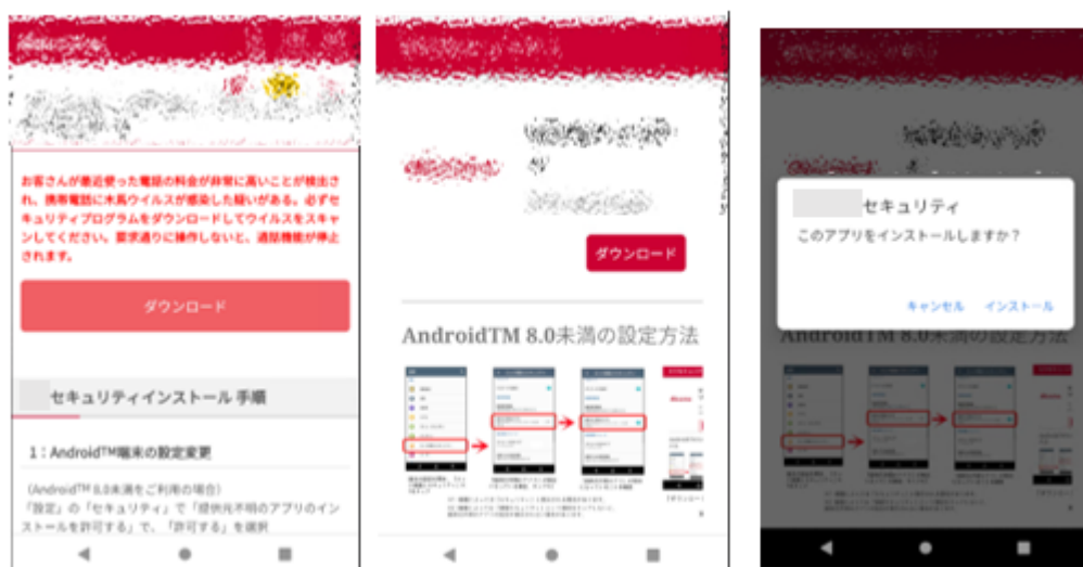
Figure 2. Malicious site accessed from an Android device

In the first pattern, TianySpy was confirmed to be infected in cases where users accessed the malicious link from both Android and iPhone devices. In the second pattern, users of Android devices were lured into accessing the malicious link, resulting in their devices being infected with KeepSpy. In the same pattern, users of iPhones who accessed the malicious link were infected with the version of TianySpy for their device.