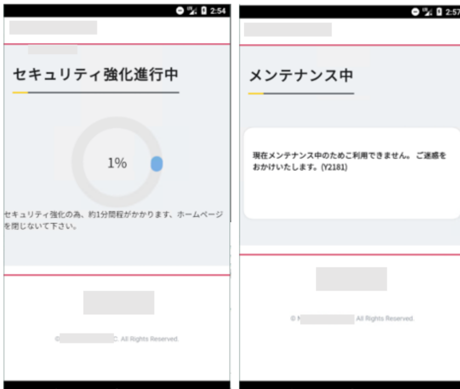
Figure 12. Contents of stop.html

The iPhone version of TianySpy shows many similarities with its Android version, such as holding encrypted strings that contain the URL of the website’s usage statement, the attacker’s email address, and stop.html. Hence, the iPhone version of TianySpy is highly likely to steal credentials and send them to the attacker.