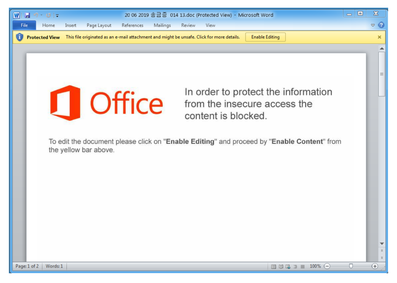
Figure 2: Example TA505 document used to deliver AndroMut

The second campaign targeted recipients at financial institutions in Singapore, UAE, and the USA. The message lures used the following details: