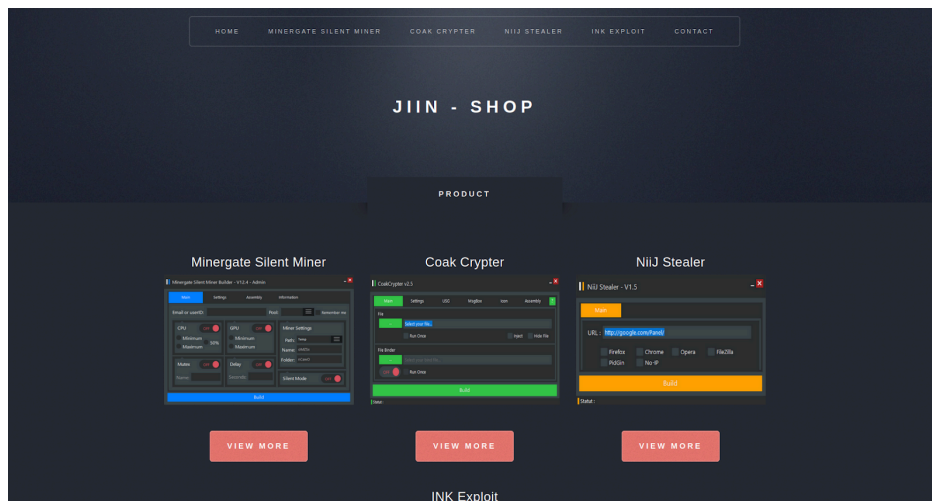
Figure 10: JiiN Shop

The website called “JiiN shop” is based on the username of malware developer/seller and hosted at “xmr-services[.]com.” It is used to advertise and sell different malware products. The threat actor is using https://shoppy[.]jgg for handling cryptocurrency payments. He is also selling some additional stuff on shoppy.