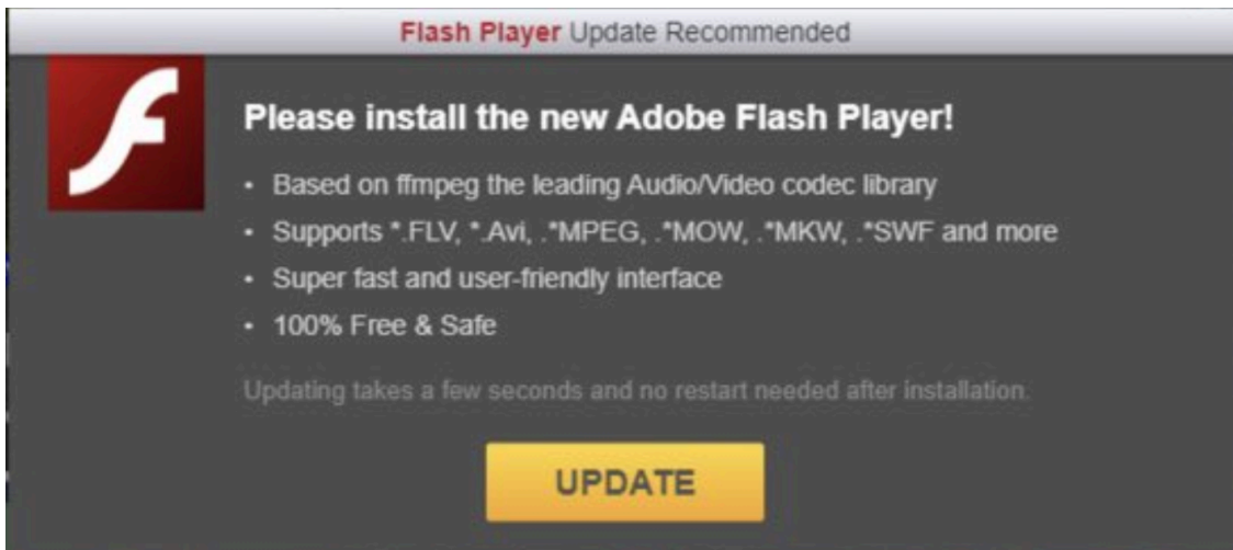
Fake Flash Player update notification

While Flash player is reaching end of life on December 31, 2020 and all major browsers will stop supporting it in a couple months, Flash Player updates are still quite a popular lure for social engineering attacks that trick people into installing malware on their computers.