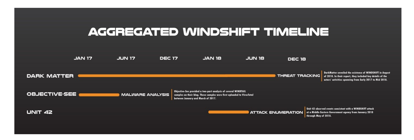
Figure 1: Known WINDSHIFT activity across main disclosure sources.

The following timeline summarizes validated WINDSHIFT activity through June of 2018.