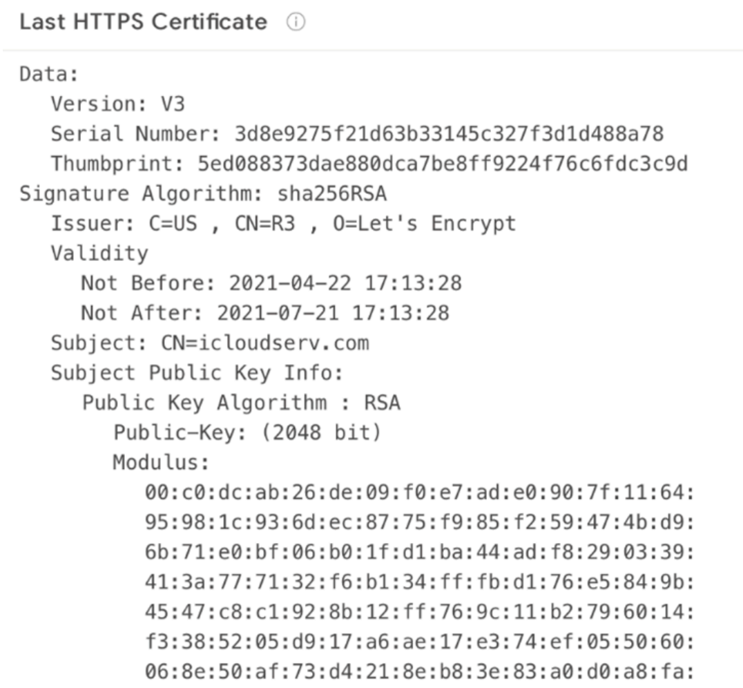
Figure 5. HTTPS certificate for C&C servers

All these new domain names have an HTTPS certificate from “Let’s Encrypt,” which is valid from April 22 to July 21, 2021.