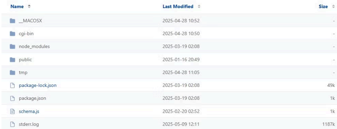
Exposed web root directory of api.release-drivers[.]online

For example, api.release-drivers[.]online was exposing its web root directory, the files it contained, and their associated modification timestamps. This included error logs from a Node.js application stored in /home/relefmwz/api.release-drivers[.]online/ , indicating that the threat actors used the username relefmwz . The exposed timestamps provide insight into when the Contagious Interview operators deployed content to the server, allowing us to reconstruct their activity timeline.