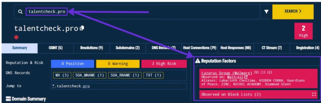
Reconstructed navigation path of the jimmr6587[.]gmail.com account

Based on log files, we were able to reconstruct the exact navigation paths of the Contagious Interview threat actors within Validin. We observed a strong interest in external references that provide attribution information for specific search terms, which Validin displays in the Reputation Factors panel on the search results page. For most of the domains they searched, the threat actors visited every available external reference, demonstrating a determined effort to conduct thorough CTI investigations by gathering information from multiple sources.