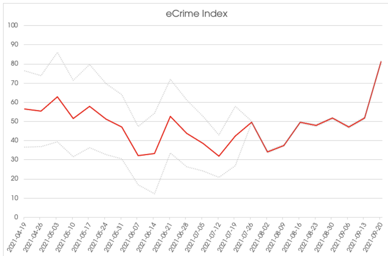
Figure 2. ECX values by week since the Colonial Pipeline incident

While the ECX models a wide range of data points within the eCrime marketplace, it is clear that a recent surge in data leaks is reflected in the ECX. Also having a significant impact on the ECX is the number of high ransom demands. For example, PINCHY SPIDER REvil affiliates have been observed issuing a ransom demand of $80 million USD, and CARBON SPIDER’s BlackMatter affiliates have been observed demanding as much as $60 million USD in the past weeks. The combination of these factors has resulted in a significant increase in the ECX (Figure 2).