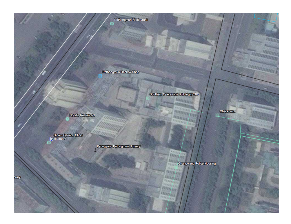
Satellite Image of the RGB Southern Operations Building in Pyongyang.

intelligence elements. Subordinate to the KPA, it has since emerged as not just the dominant North Korean foreign intelligence service, but also the center for clandestine operations. The RGB and its predecessor organizations are believed responsible for a series of bombings, assassination attempts, hijackings, and kidnappings commencing in the late 1950s, as well as a litany of criminal activities, including drug smuggling and manufacturing, counterfeiting, destructive cyber attacks, and more.