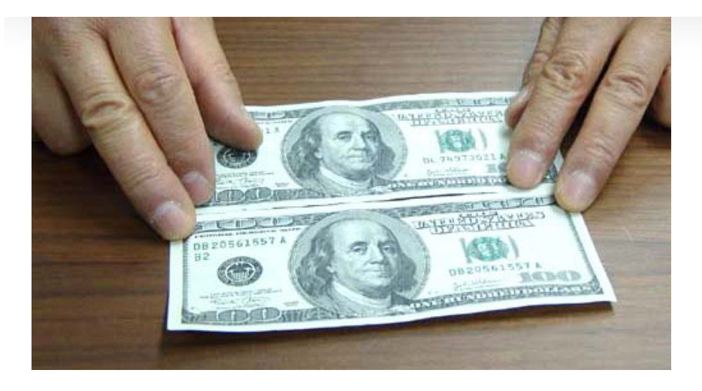
"Supernote" and a real $100 bill.

<u>Distribution and production</u> of the supernotes followed a similar pattern to North Korean-produced narcotics, utilizing <u>global criminal syndicates</u>, <u>state and intelligence officials</u>, and <u>legitimate businesses</u>. North Korea has repeatedly denied involvement in counterfeiting or any illegal operations.