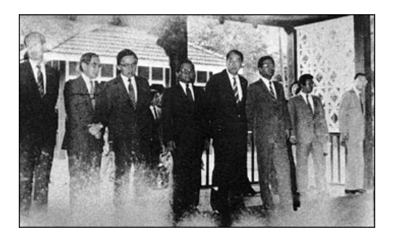
South Korean officials wait at the mausoleum in Rangoon minutes before the bomb detonated.