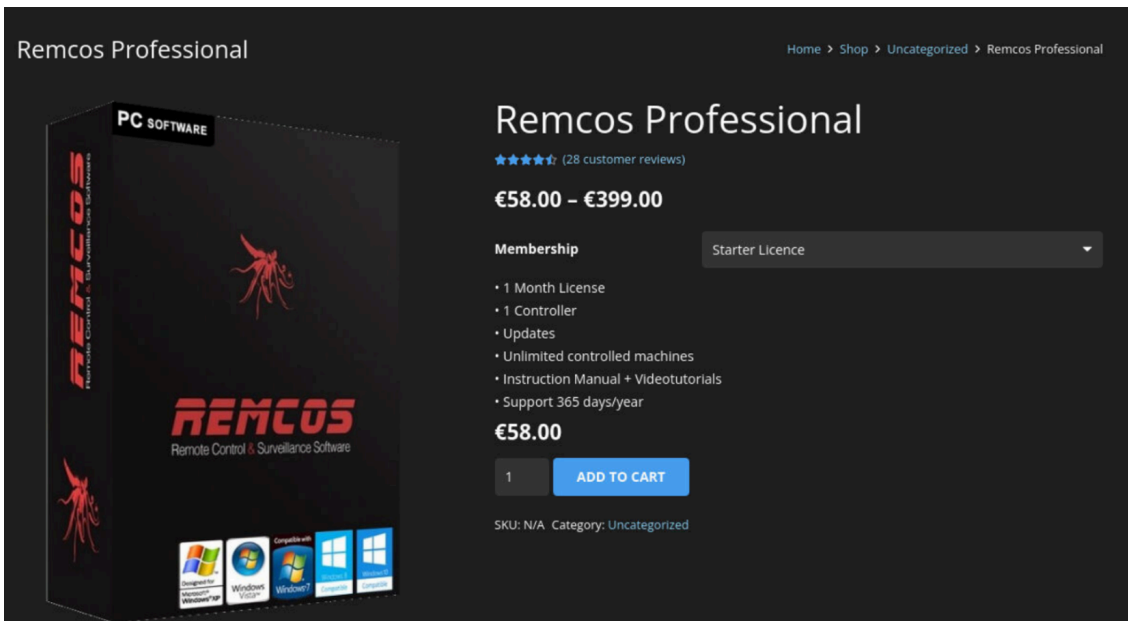
Figure 1 Online purchasing form for Remcos