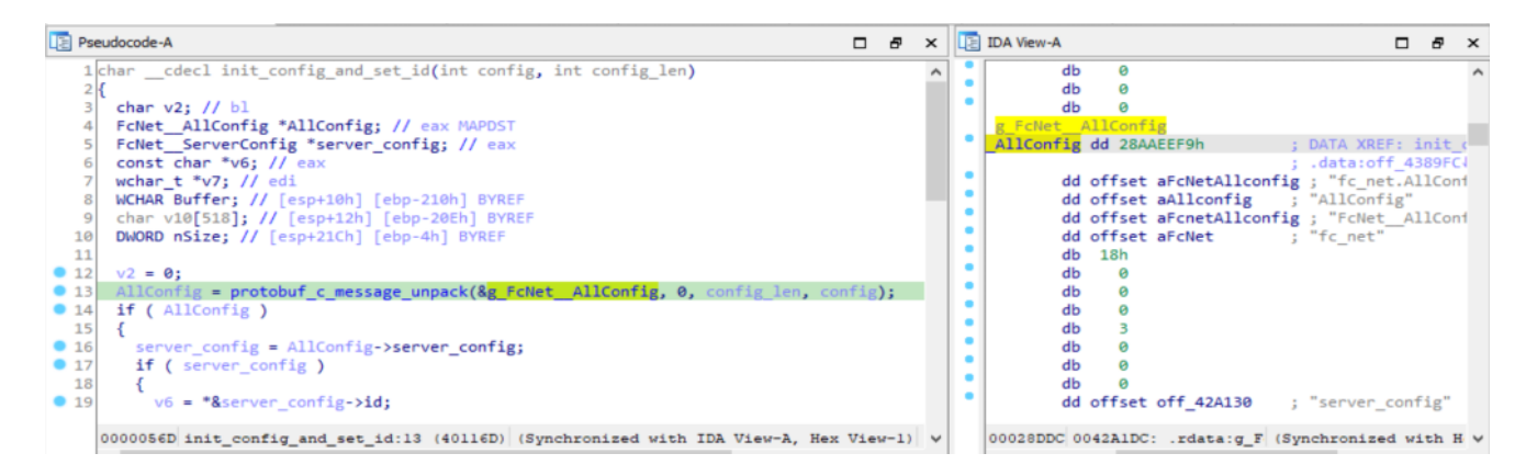
Figure 3 Configuration data's associated ProtobufCMessageDescriptor

associated <u>ProtobufCMessageDescriptor</u> and <u>ProtobufCFieldDescriptor</u> structures can be identified as shown in Figure 3: