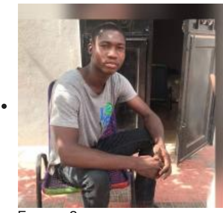
Fouss - 2 years ago