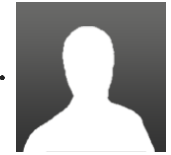
donovancraig69 - 2 years ago

Please I need Nemty's decryption software quickly